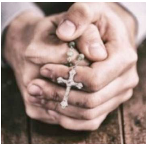
October is the Month of the Rosary

Rise Youth Festival: St. Joseph's Heritage and Conference Centre, Perthville. October 11-12th, 2018. RISE is a chance for young people in Year 6 to Year 9 to spend time together, have fun and learn more about their faith. See brochure at the back of the Churches this weekend.