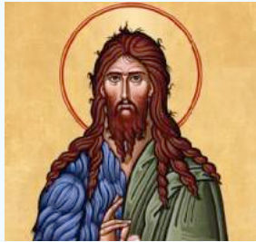
St John's Baradine

We acknowledge the original owners of this land, and pay respects to the elders and deceased members, of the Gamilaroi people.